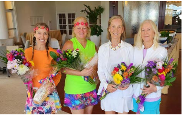
See the entire photo gallery on the Club Website