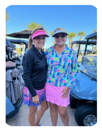
See the entire photo gallery on the Club Website