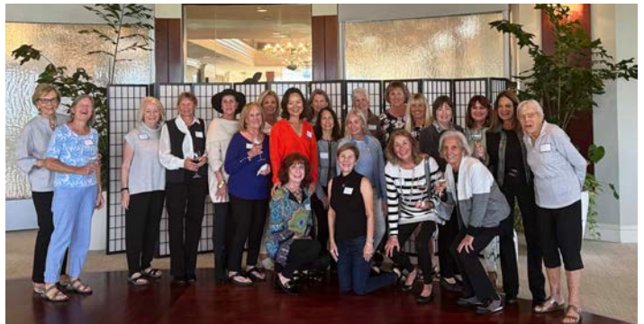
Fall Social November 1