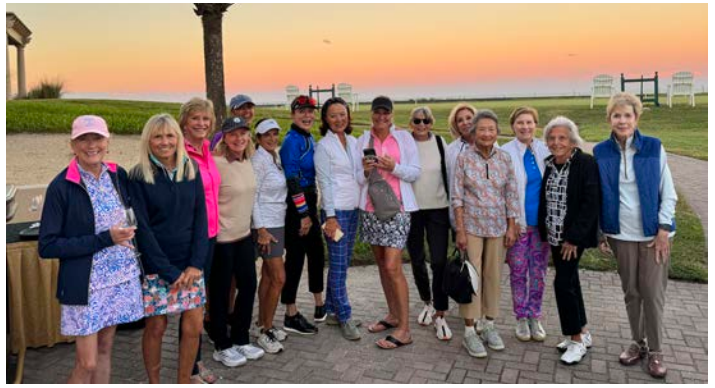
Nine and Wine October 18