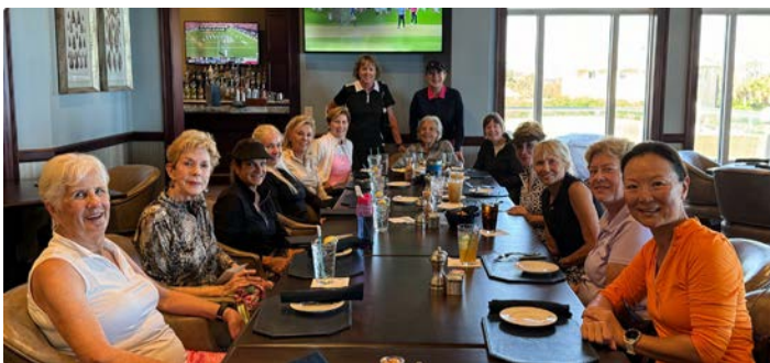
November 8 Ladies Day