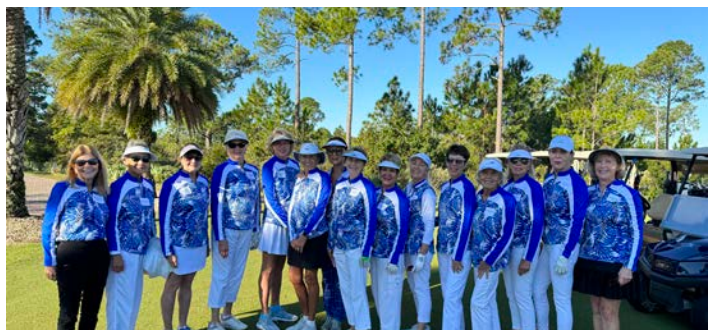
Coastal Niners November 6