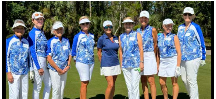
Coastal Niners October 20