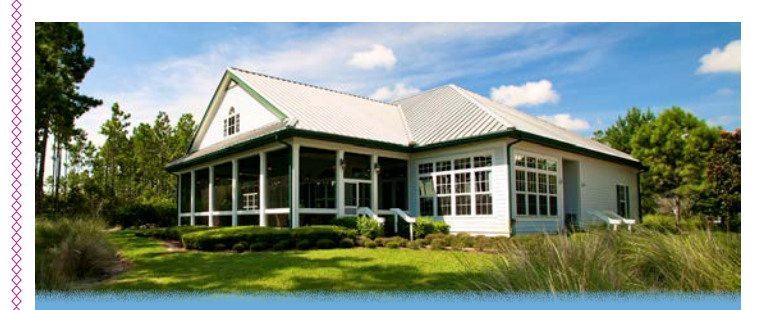
Join us for Dinner at the Creek Mondays from 5 - 9 p.m.

Click Dining Reservations or Call the Reception Desk for your reservations 386-445-0747