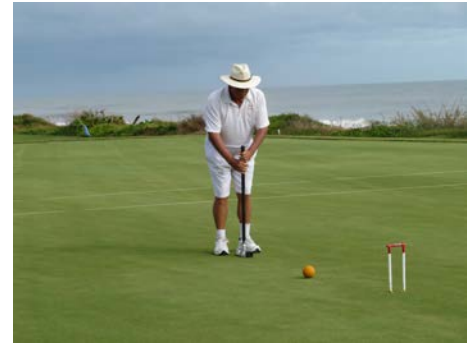
Above: October Interclub Matches with Florida Yacht Club

Below: Of course, Halloween was celebrated wearing the most unique costumes!!