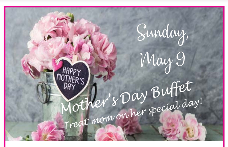
Limited Seating every half hour from 10 am – 2 pm