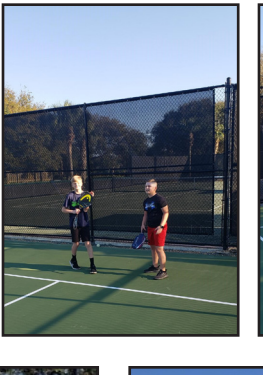
Dunescape page 12