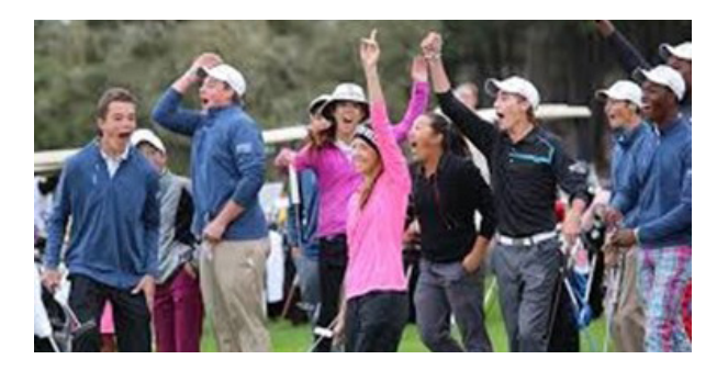
Teens: Are you ready for some golf clinics?

Click or Call today for your reservations hammockdunesclub.com | 445-0747